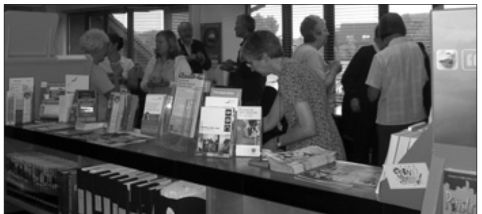
Arsenic in the tea-cups? Not this time. This is Medway Libraries and the coffee-and-quiz party they held to thank the volunteers who help with the home library service.

As I don't have any ambitions in this direction I am not sure how good the advice is, although the gist of it is that writing is a difficult profession from which to make money. But it is a light read, and any pearls of wisdom will not be difficult to reach.